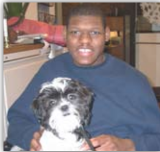
Elim's residents love spending time with their friendly dorm dog!

Spending time with Harley has also become a great incentive for continued positive behavior from some residents. Harley draws expressions of love from Elim's residents each day. One resident, who for a long time has been very fearful of dogs, now gives the "thumbs up" signal every time she pets or holds him. Each day, Harley serves as a reminder that God sometimes gives us joy in very small packages.