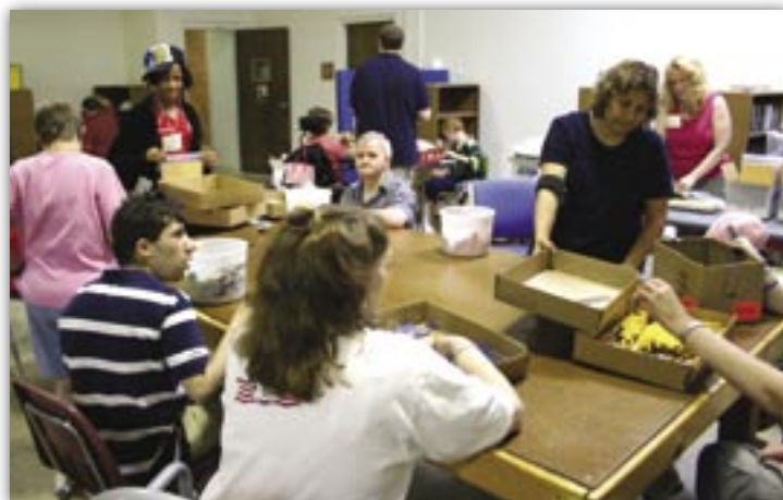
Elim's adults and church volunteers collaborate to bless others worldwide.