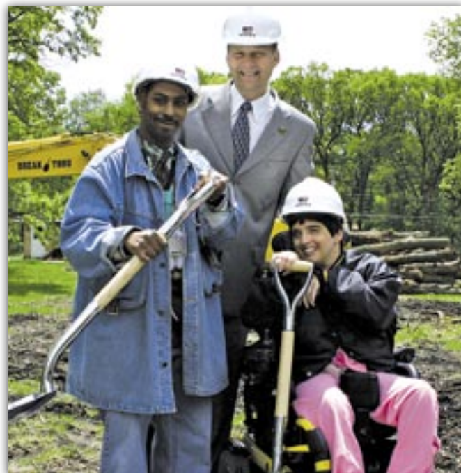
Breaking ground for Elim's new Adult Services building.

A letter has been sent to local churches asking for volunteers to help with the project. If you, your church, or anyone you know is interested in volunteering with this project, please contact Tehrifah Brown at (708) 389-0555.